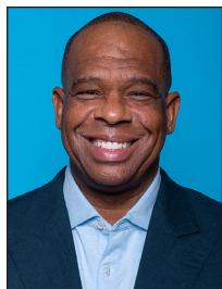
HUBERT DAVIS Head Coach

The 2025-26 season is Hubert Davis' fifth as head coach at the University of North Carolina and his 14th on the coaching staff at his alma mater. He is the only Tar Heel head coach to win 20 or more games in each of his first four seasons.