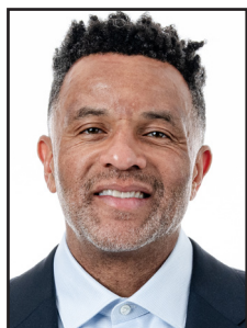
Damon Stoudamire Head Coach