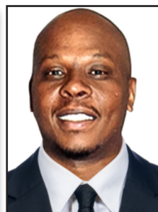
Bonzi Wells Assistant Coach