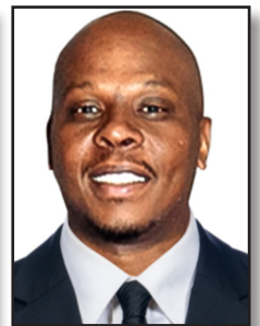
Bonzi Wells Assistant Coach