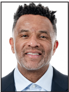
Damon Stoudamire Head Coach