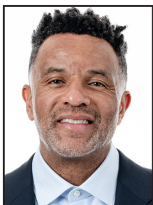
Damon Stoudamire Head Coach