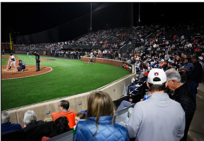
Hall of Fame Club