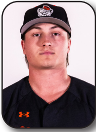
20 ELY BROWN SO | OF