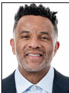
Damon Stoudamire Head Coach