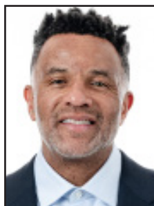
Damon Stoudamire Head Coach