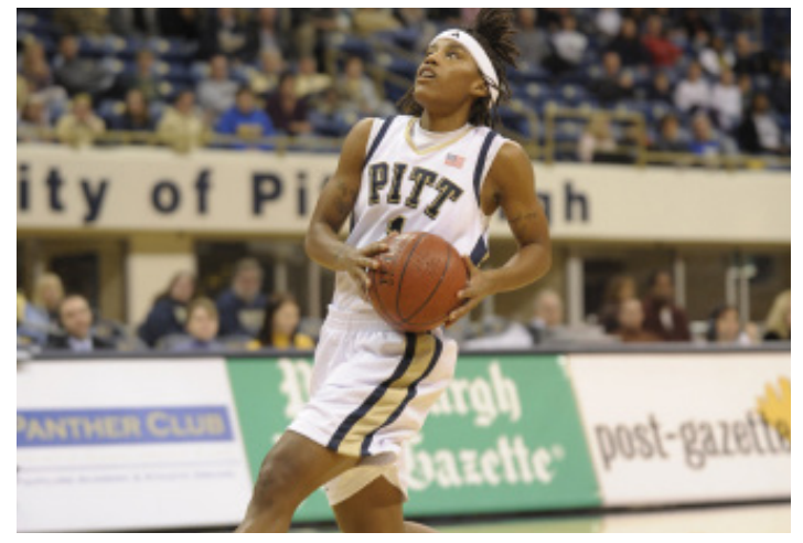
Pitt great Shavonte Zellous is the last Pitt player to score 40 points in a game as she netted 42 in a win over Florida on Dec. 21, 2008.