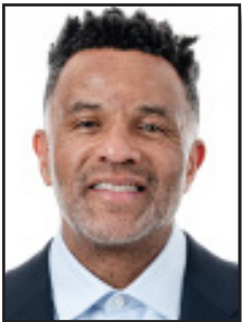
Damon Stoudamire Head Coach