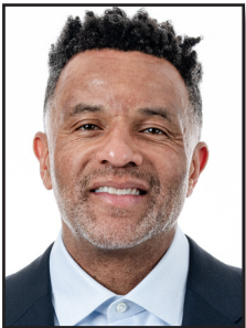
Damon Stoudamire Head Coach