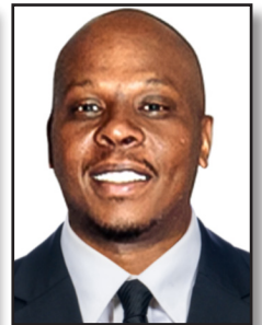
Bonzi Wells Assistant Coach