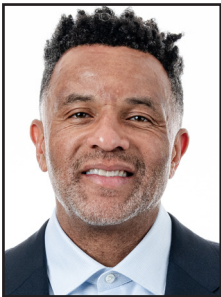
Damon Stoudamire Head Coach