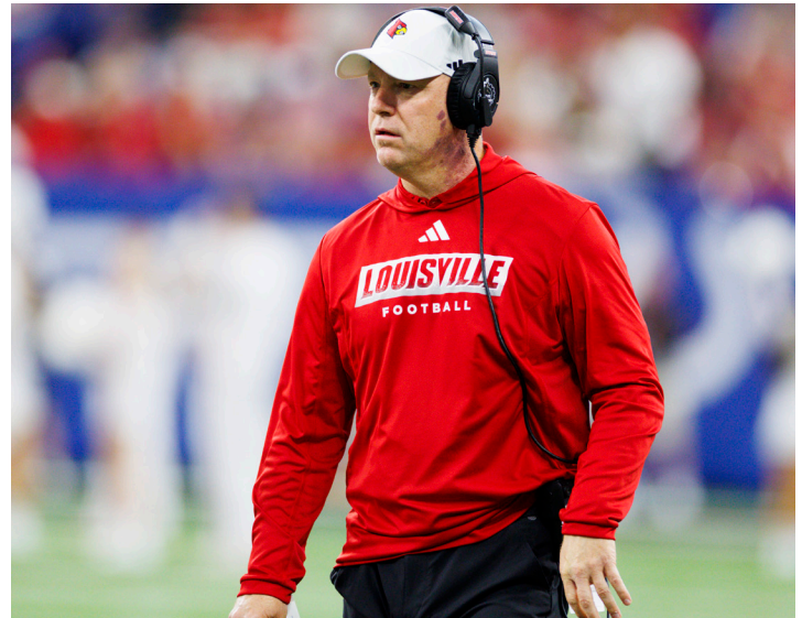
and Cleveland Browns (2000).