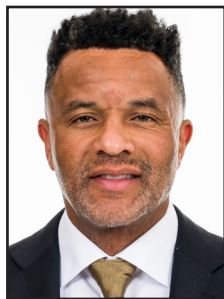
Damon Stoudamire Head Coach