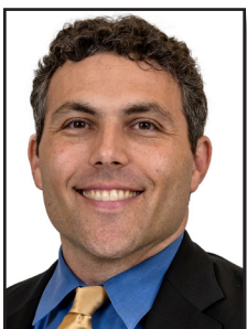
Josh Pastner Head Coach