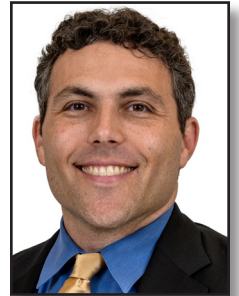
Josh Pastner Head Coach