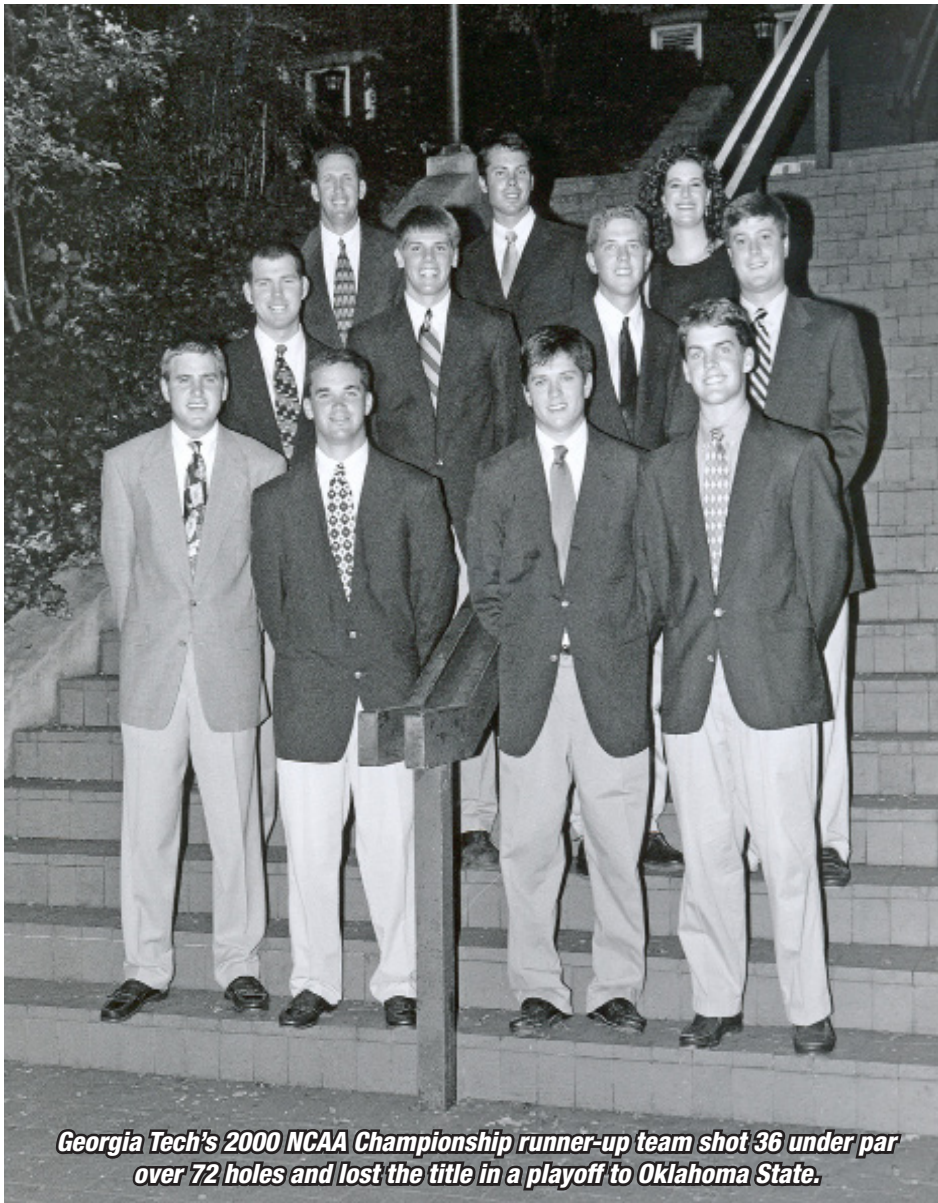
Georgia Tech's 2000 NCAA Championship runner-up team shot 36 under par over 72 holes and lost the title in a playoff to Oklahoma State.

The finals structure changed again in 2009, with 30 teams playing 54 holes of stroke play. The individual national champion was crowned after 54 holes, and the top eight teams advanced to a match play bracket to decide the team champion. In 2015, the NCAA added a fourth 18-hole round to the stroke-play portion, cutting the field to the top 15 teams and nine individuals not on those teams for the final round, which determined the medalist