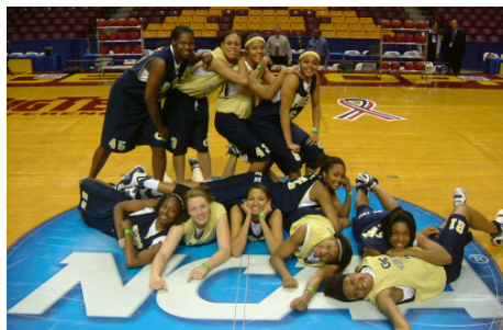
The Yellow Jackets made it to the NCAA Tournament in 2007 which was the first of six-straight appearances in the Big Dance from 2007-12.

BIG EAST: 2-1 Big Ten: 1-3 Mid-American: 1-0 Northeast: 1-0 SEC: 0-1 Southland: 1-0 Sun Belt: 0-1