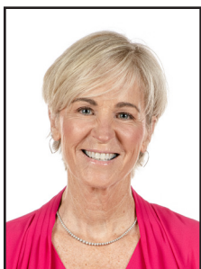
Nell Fortner Head Coach