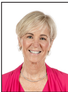
Nell Fortner Head Coach