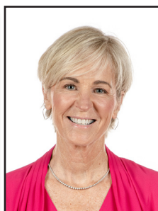
Nell Fortner Head Coach