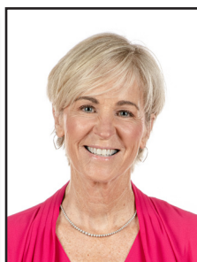
Nell Fortner Head Coach