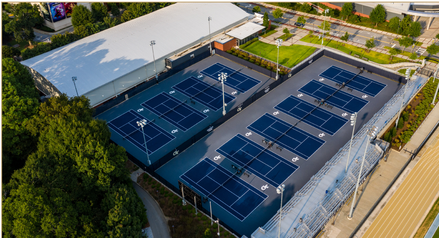
Ken Byers Tennis Complex: Home to Georgia Tech Tennis During August 2020, the Ken Byers Tennis Complex underwent standard court resurfacing.