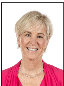
Nell Fortner Head Coach