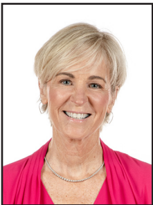
Nell Fortner Head Coach