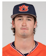
11 CHASE HALL