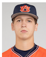
21 TRACE BRIGHT