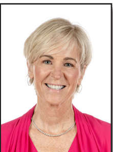
Nell Fortner Head Coach