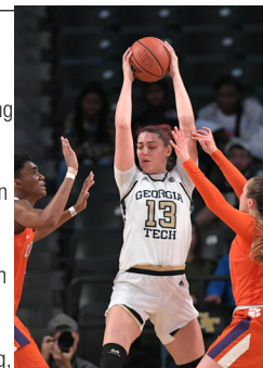
Georgia Tech picked up its first-ever win in the Carrier Dome last Thursday.