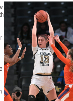
Georgia Tech seeks its first win at Syracuse Thursday night.