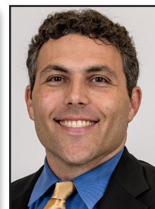
Josh Pastner Head Coach