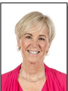
Nell Fortner Head Coach