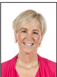
Nell Fortner Head Coach