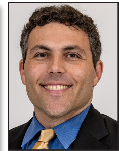
Josh Pastner Head Coach