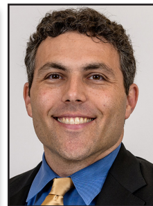
Josh Pastner Head Coach