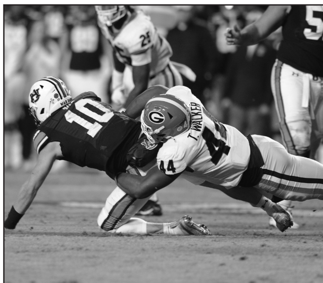
Travon Walker sealed the game and SEC Eastern Division title with his 4th-down sack of Bo Nix, the first solo sack of his career.