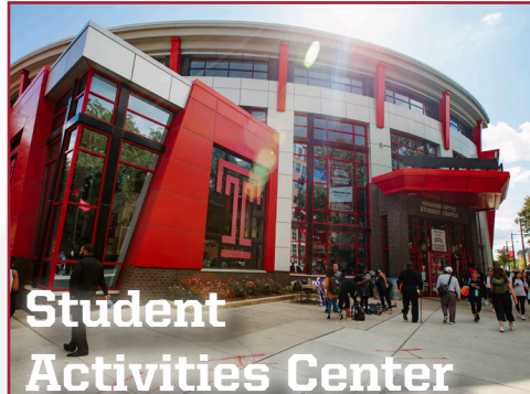
Student Activities Center