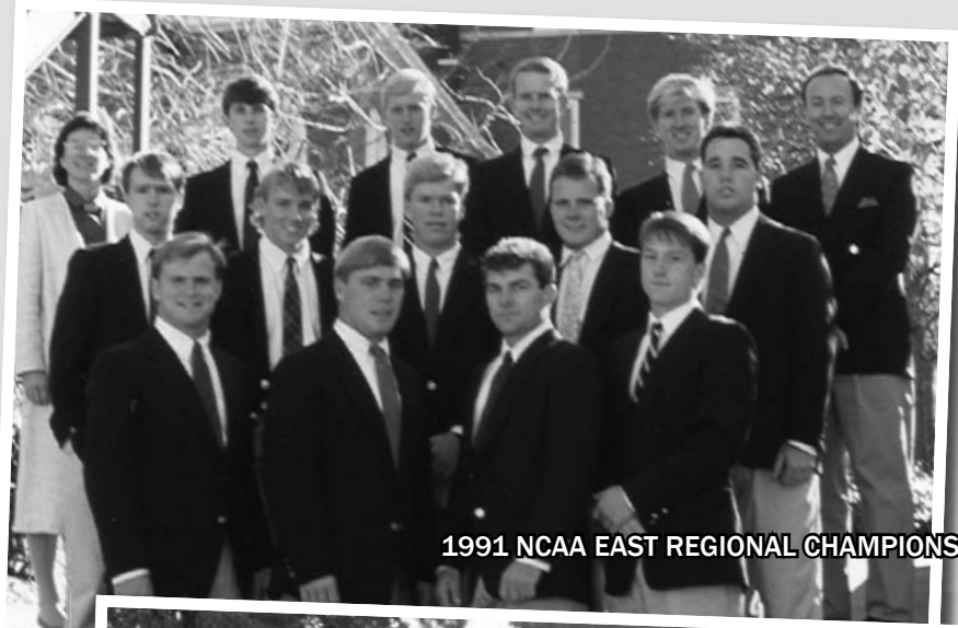
1991 NCAA EAST REGIONAL CHAMPIONS

The finals structure also changed in 2009, with 30 teams playing 54 holes of stroke play. The individual national champion is crowned after 54 holes, and the top eight teams advance to a match play bracket to decide the team champion.