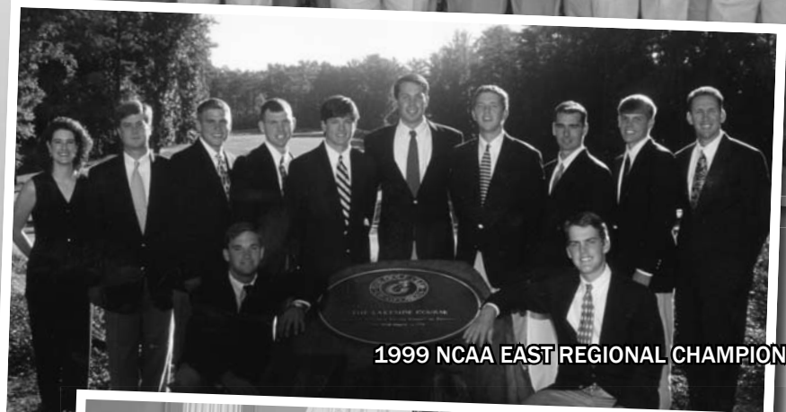
1999 NCAA EAST REGIONAL CHAMPIONS