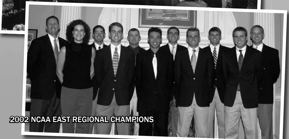
2002 NCAA EAST REGIONAL CHAMPIONS