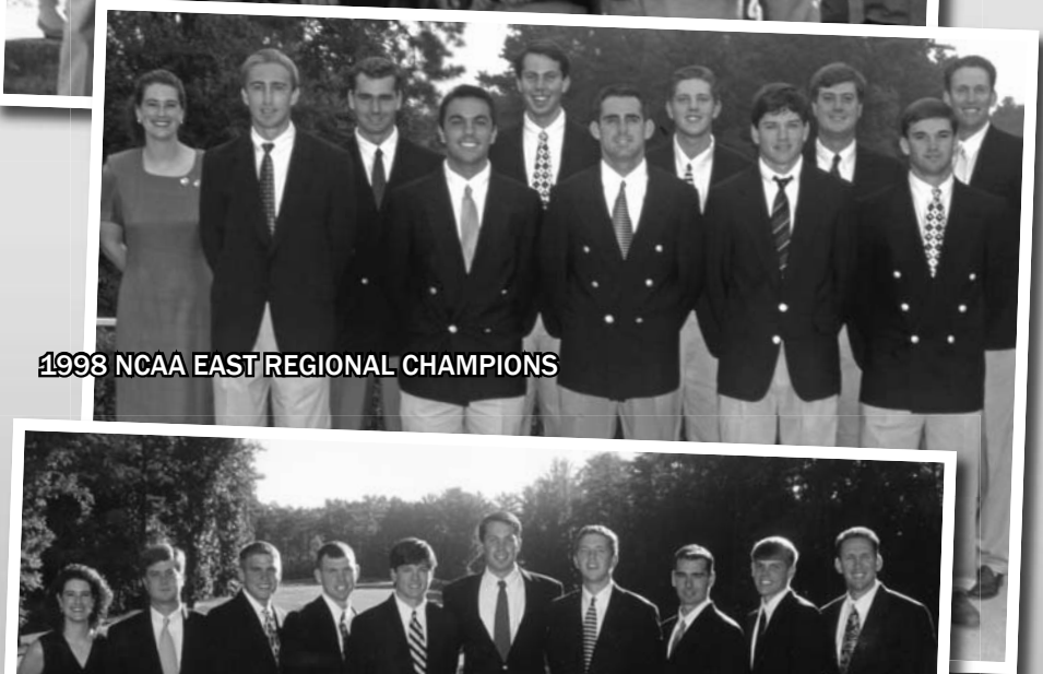
1998 NCAA EAST REGIONAL CHAMPIONS