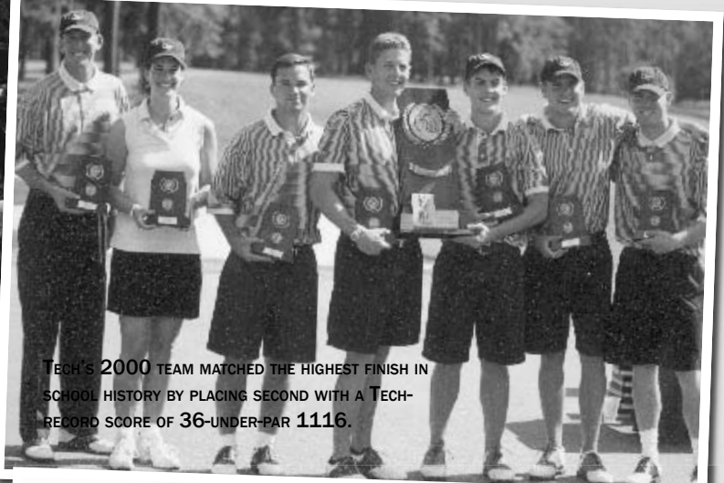
TECH'S 2000 TEAM MATCHED THE HIGHEST FINISH IN SCHOOL HISTORY BY PLACING SECOND WITH A TECH-RECORD SCORE OF 36-UNDER-PAR 1116.