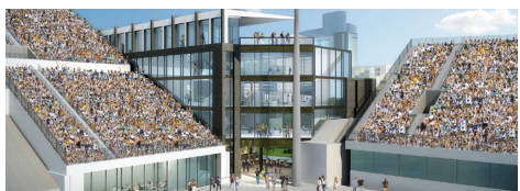
New $70 million Edge-Rice Center; coming early 2020s